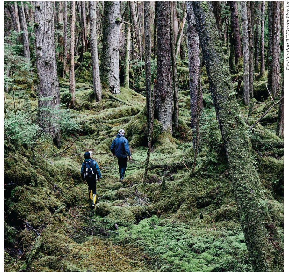
Hikers explore the forest near Kiusta, an ancient Haida village site on the northwest coast of Graham Island, just south of Langara Island.

520-615-2779 2200 East River Road, Suite 109, Tucson, AZ 85718 www.gordianadvisors.com